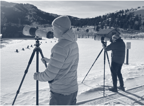
Watch Cody Yellowstone: Winter Photography Workshop, showing creative ideas and tangible results.